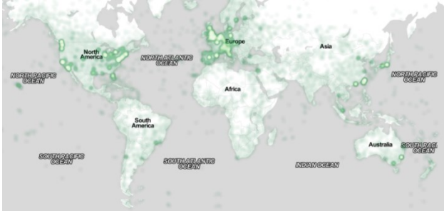
Figure 4: Calculated spatial distribution of the in-plane dynamic magnetization.

They exhibit marked localization into either the Co or the Py dots, as stated at the end of the previous Section, were it was introduced the labelling notation containing the dominant localization region (either Py or Co) and the spatial symmetry (EM, F, DE, etc).