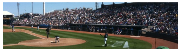
Figure 1: MOKE hysteresis loop for the bi-component Py/Co dots array measured along the dots long axis.

WOODSTOCK'97, July 2016, El Paso, Texas USA © 2016 Copyright held by the owner/author(s). 123-4567-24-567/08/06... $15.00 DOI: 10.1145/123_4