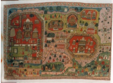
Figure 6: Calculated frequency evolution of modes detected in the BLS spectra.

In Fig. 6 the calculated frequencies of the most representative eigenmodes at +500 Oe (FM state) and - 500 Oe (AP state) are plotted as a function of the gap size d between the Py and Co sub units (please remind that in the real sample studied here, d = 35 nm). As a general comment, it can be seen that the frequencies for the system in the AP state are more sensitive to d than those of the P state. In particular, the lowest three frequency modes of the AP state (EM(Co), EM(Py) and F(Py)) are downshifted with respect to the case of isolated elements (dotted lines) and show a marked decrease with reducing d , while the two modes at higher frequencies (F(Co) and 1DE(Py)) have an opposite behavior even though they exhibit a reduced amplitude. In the P state (right panel), the modes concentrated into the Py dots exhibit a moderate decrease with reducing d , while an opposite but less pronounced behavior is exhibited by the F(Co) mode.